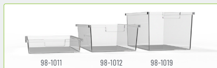
Clear storage trays available in 3 sizes: 3", 6" and 9" heights