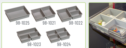
Storage divider tray inserts available in 5 different styles