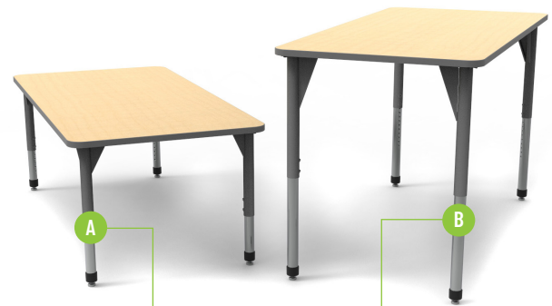
Sitting Height Leg Adjust from 21" - 31"