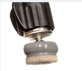
Felt glides available V-Back stacking chair models