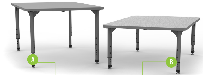
Standard Leg Adjust from 21" - 30"